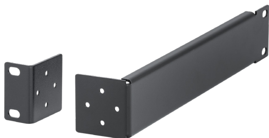
DMPA Light B1

DMPA Light B1 & DMPA Light B2 – Optional steel brackets for mounting 1 or 2 DMPA series amplifiers in 1U 19" equipment rack space.